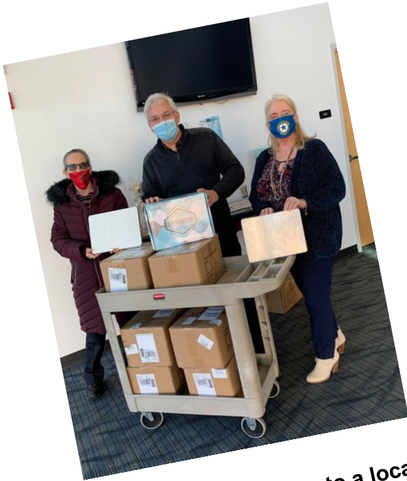
Unit 25 donates white boards to a local Elementary School for use during virtual learning.