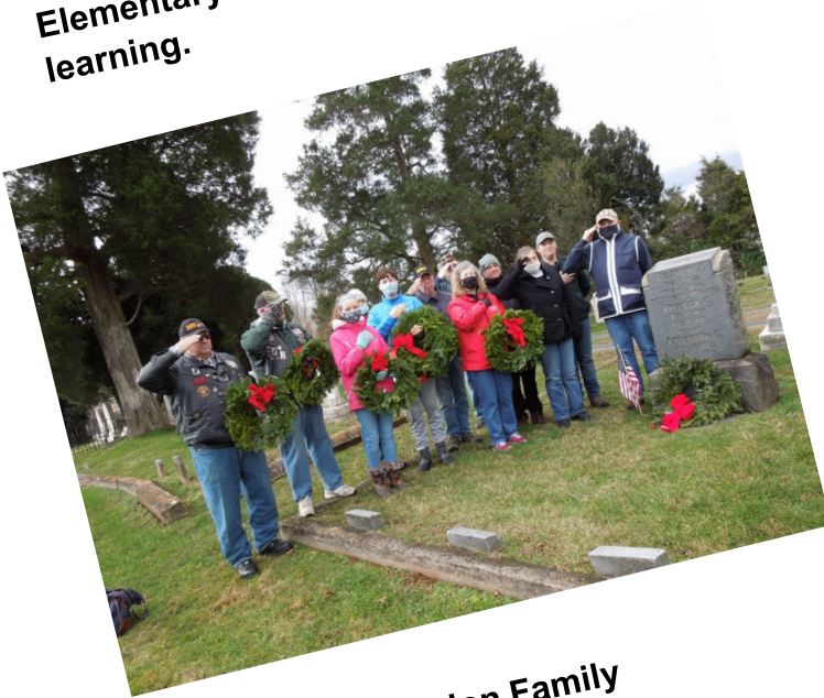
Manassas 10 Legion Family was among many Posts, Units and Squadrons participating in Wreaths Across America.