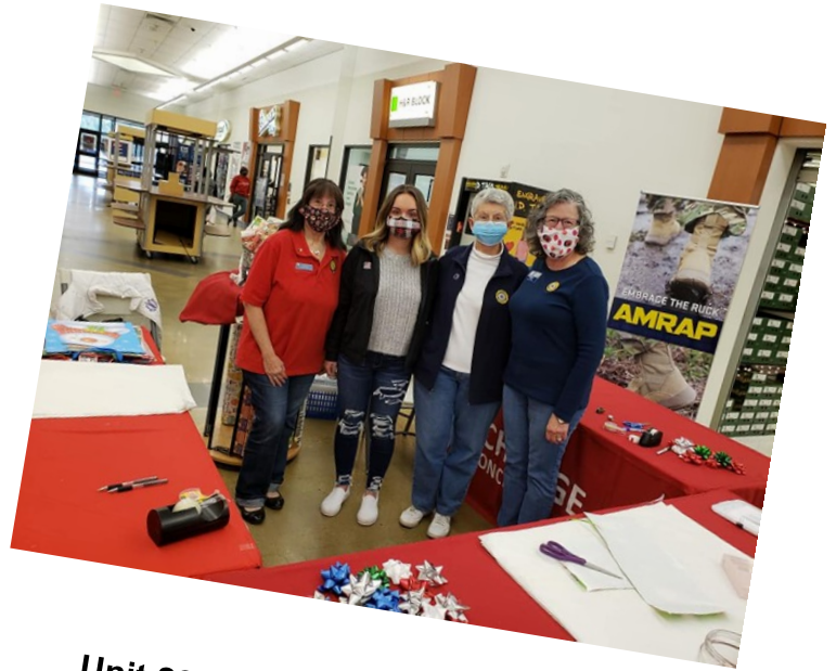
Unit 284 members wrapped gifts at Fort Lee.