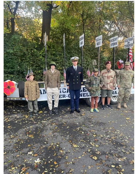
Unit 180 Family Parade