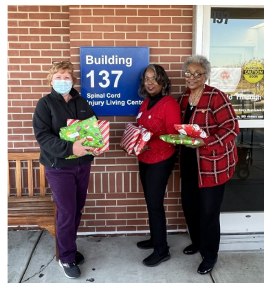
Hampton VA Medical Center Gift Giving