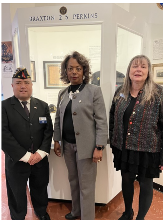
Unit 25 Museum Night