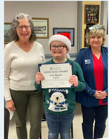
Unit 284 Good Deed Award Presentations

One of the organizations that the ALA collaborates with is the Military Child Education Coalition (MCEC). The Military Child Education Coalition® (MCEC®) delivers programs, services, and professional development to meet the needs of military-connected students, parents, and professionals. It is a great resource for the Month of the Military Child activities and supplies as April is fast approaching! The link is https://www.militarychild.org .