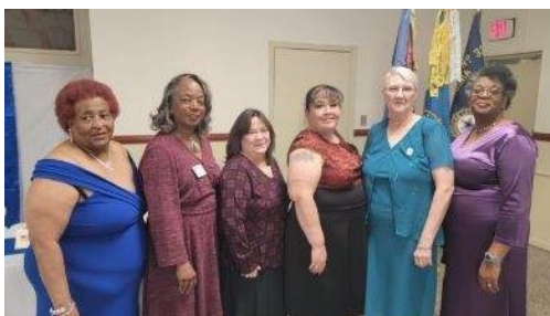
Unit 327 75th Anniversary