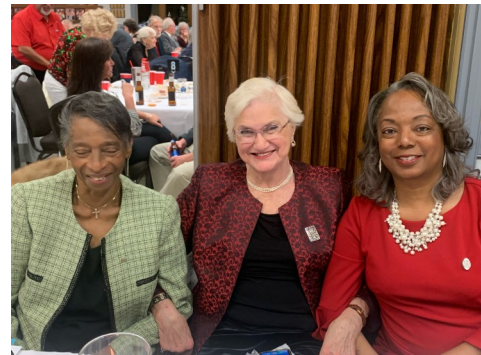
Unit 284 Holiday Event